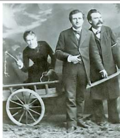
Paul Rée, Friedrich Nietzsche and Lou Andreas-Salomé (1882)

*More of the Rée quote: The volition, it is explained, is, indeed, the cause of the donkey's turning round, but is itself unconditioned; it is an absolute beginning, a first cause and not a link in a chain of events... But a presumption of this kind is contradicted by experience and the universal validity of the law of causality... Let us now leave the realm of animals and proceed to consider the human being. Everything is the same here."