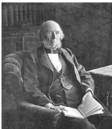
Herbert Spencer 1820–1903

It is not because I consider that the book in which it occurs has any special importance that I quote this passage, but because it seems to me to express the only view to which the thought of the majority of our contemporaries is able to rise in this matter. Every one who has grown beyond the kindergarten-stage of science appears to know nowadays that freedom cannot consist in choosing, at one's pleasure, one or other of two possible courses of action. There is always, so we are told, a perfectly definite reason why, out of several possible actions, we carry out just one and no other.