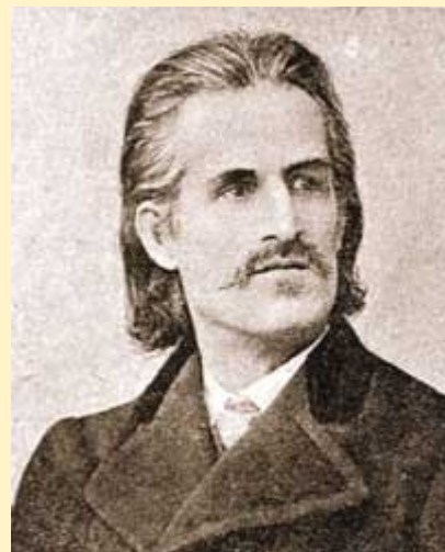
Robert Hamerling 1830-1889

The concept of motive is indissolubly bound up with that of will. Without the determining motive the will is an empty faculty; it is the motive which makes it active and real. It is, therefore, quite true that the human will is not 'free,' inasmuch as its direction is always determined by the strongest motive. But, on the other hand, it must be admitted that it is absurd to speak, in contrast with this 'unfreedom,' of a conceivable 'freedom' of the will, which would consist in being able to will what one does not will" ( Atomistik des Willens , p. 213 ff.).*