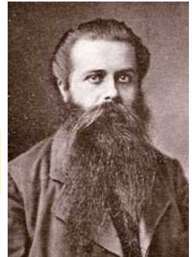
Eduard von Hartman 1842–1906

[10] It is said that man is free when he is controlled only by his reason, and not by his animal passions. Or, again, that to be free means to be able to determine one's life and action by purposes and deliberate decisions.