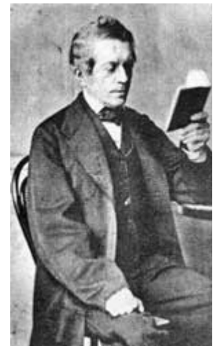
David Strauss 1808–1874

"With the question of the freedom of the human will we are not concerned. The alleged freedom of indifferent choice has been recognized as an empty illusion by every philosophy worthy of the name. The determination of the moral value of human conduct and character remains untouched by this problem."